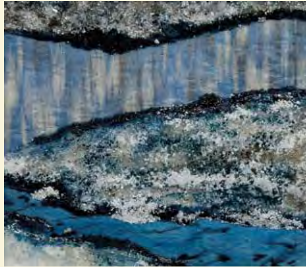
Vickie Newington, Ice Water , glass fusing, machine embroidery, hand felting, collection of the artist.